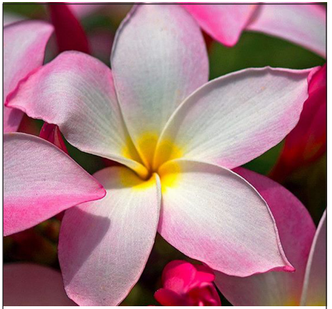
Pink Plumeria (Frangipani)