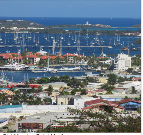
Sint Maarten/Saint Martin