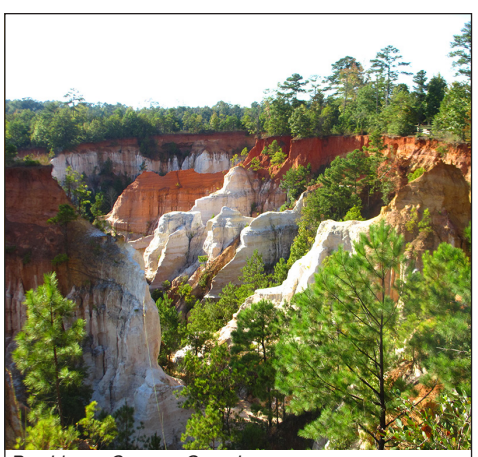
Providence Canyon, Georgia