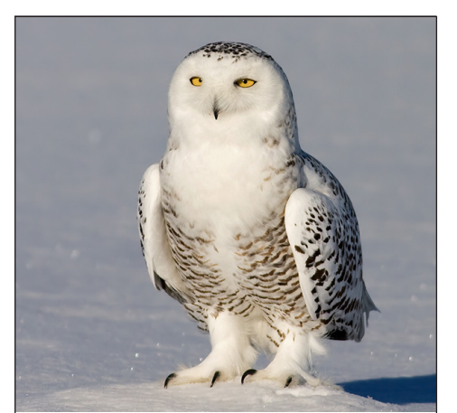
Snowy Owl, Canada