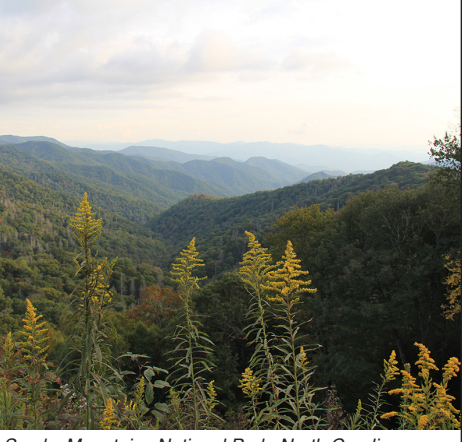
Smoky Mountains National Park, North Carolina