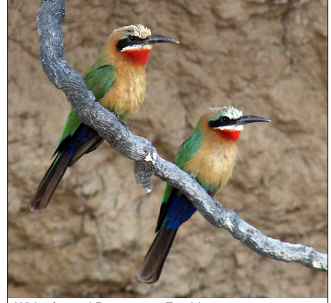
White-fronted Bee-eaters, Zambia