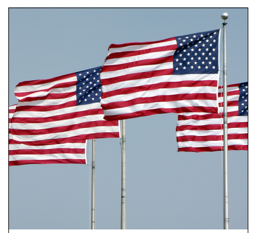
American Flags, Liberty State Park, New Jersey