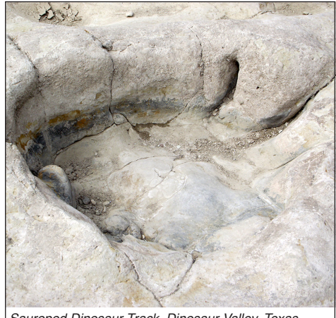
Sauropod Dinosaur Track, Dinosaur Valley, Texas