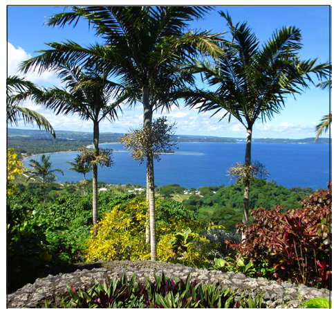
Vanuatu, South Pacific